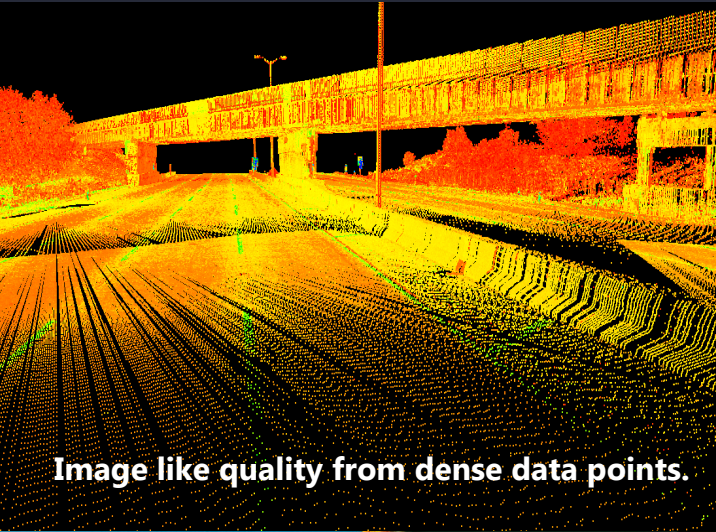
Image like quality from dense data points.